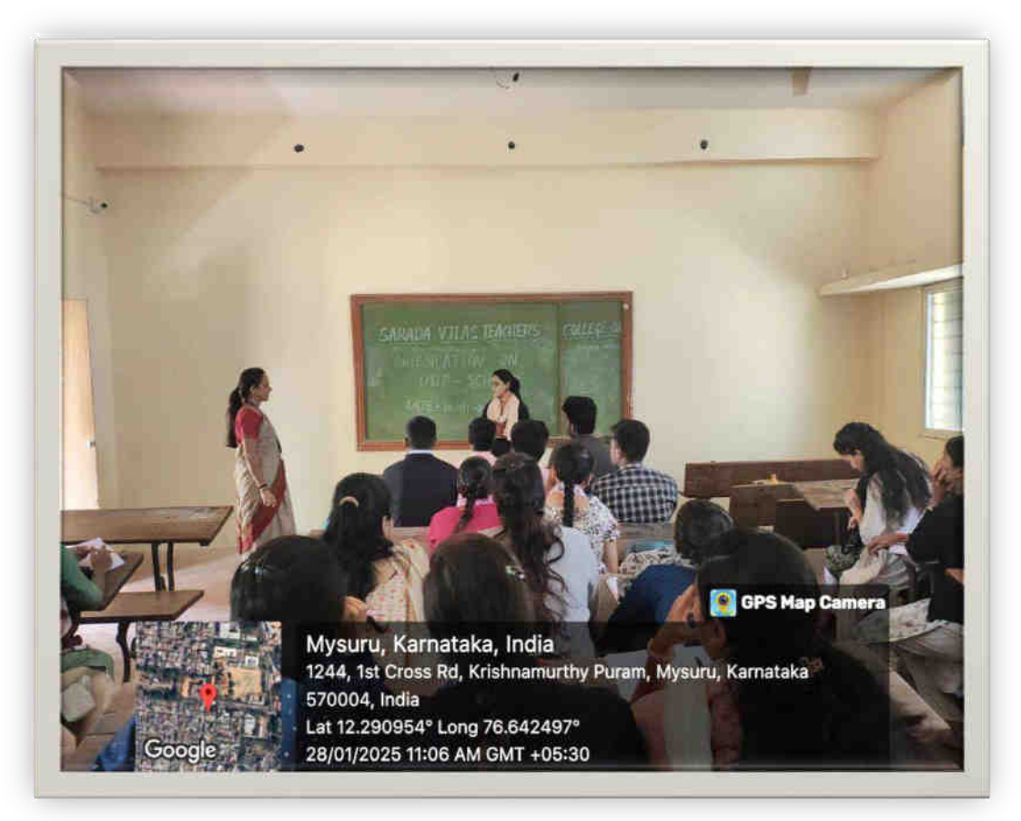
Orientation Program in UDP Science dated 28/01/2025