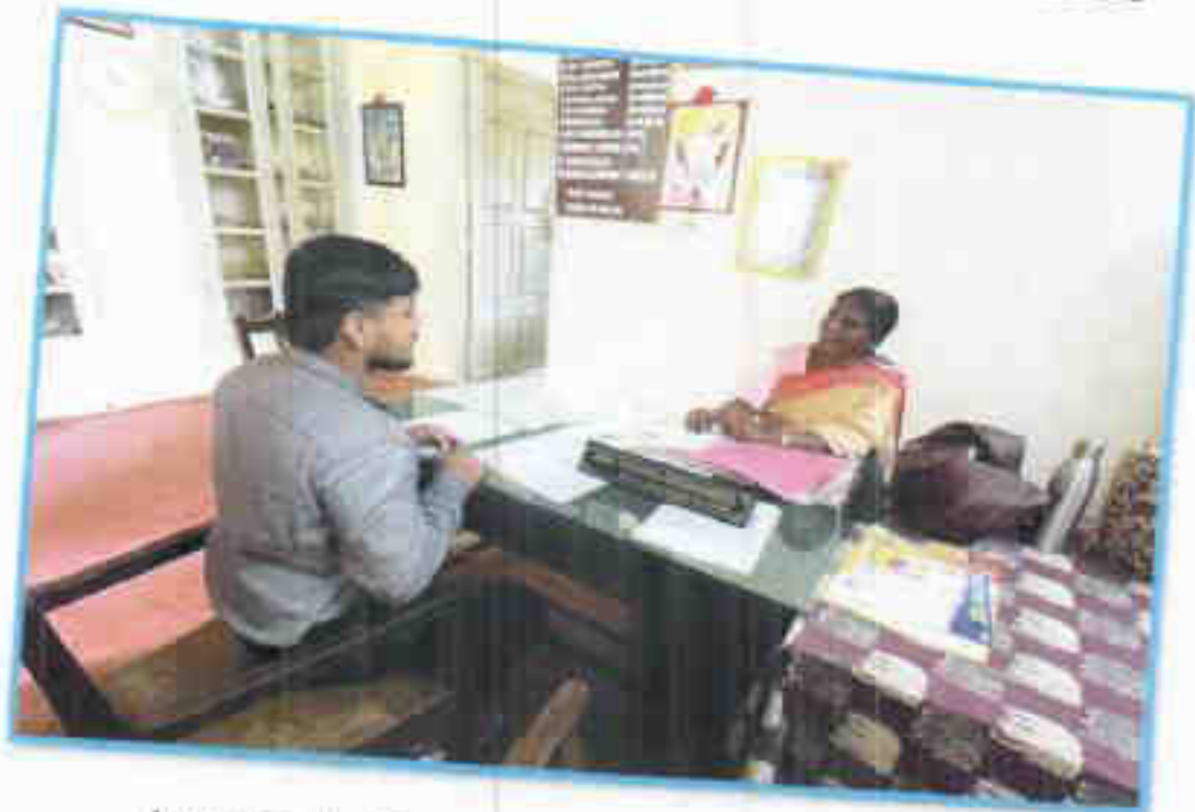
Interview held at Sharada Vilas Girls High School.