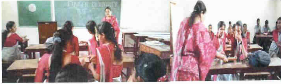
Psycho Social Tools and Technique (PSTT)